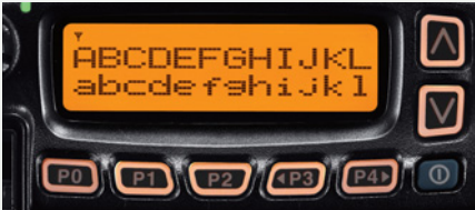
Two line setting display example.

With a high contrast dot matrix display, upper and lower case characters can be easily distinguished. You can change the display setting to show one line and 12 characters, or two lines and 24 characters via programming. LCD backlighting is standard.