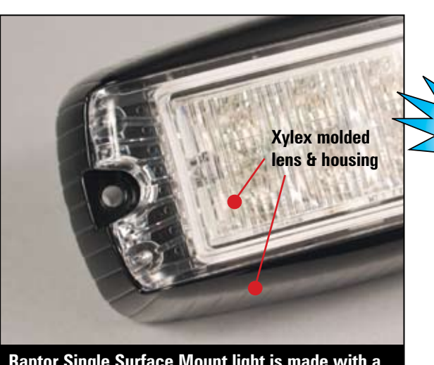
Raptor Single Surface Mount light is made with a durable & corrosion resistant Xylex lens & housing.